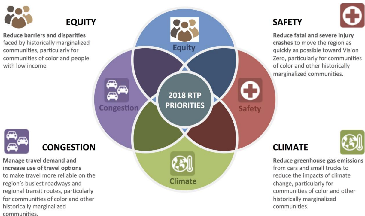
Figure 2. 2018 Regional Transportation Plan Priority Policy Outcomes

Summarized from the 2018 Regional Transportation Plan (Chapters 3 and 6)