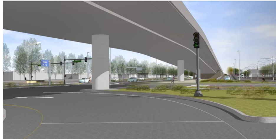
4 Eastbound U-turn would return drivers to the terminal (merges). Westbound Airport Way would stop for pedestrians and bikes.