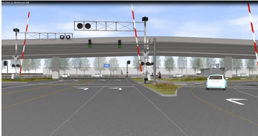
Looking north on 82 nd , airport traffic would travel under eastbound traffic.

Task Force: 75% recommendation, Port agreement on Alderwood-Killingsworth trail