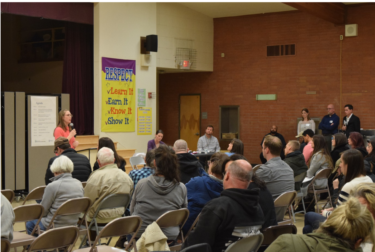
Photo 5: Community conversation and DEQ public hearing at Shaver Elementary School on April 9, 2019