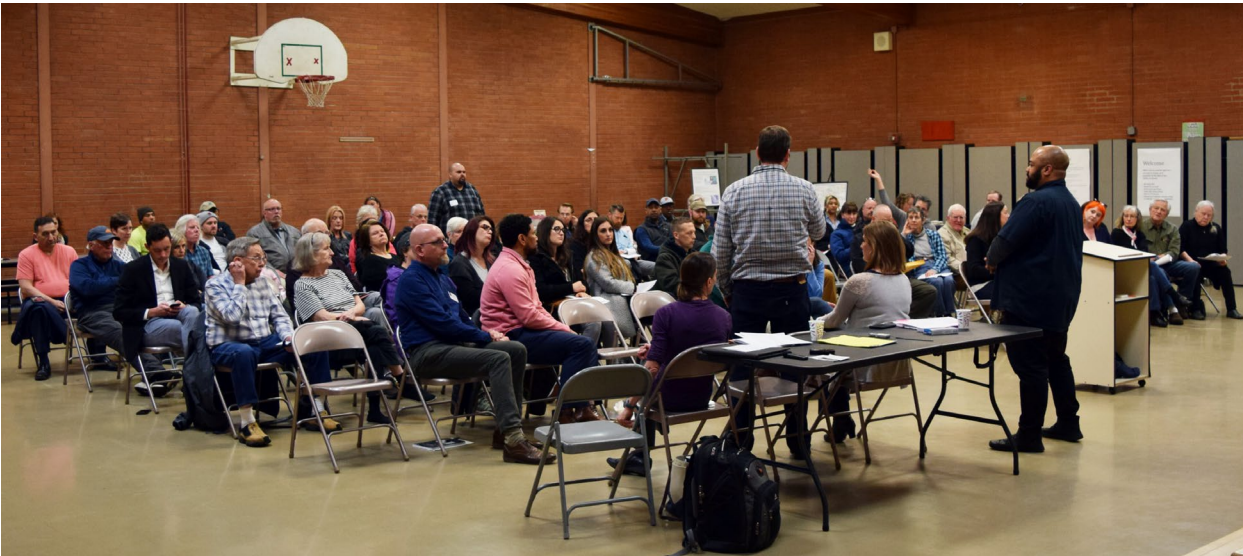
Photo 4: Community conversation and DEQ public hearing at Shaver Elementary School on April 9, 2019