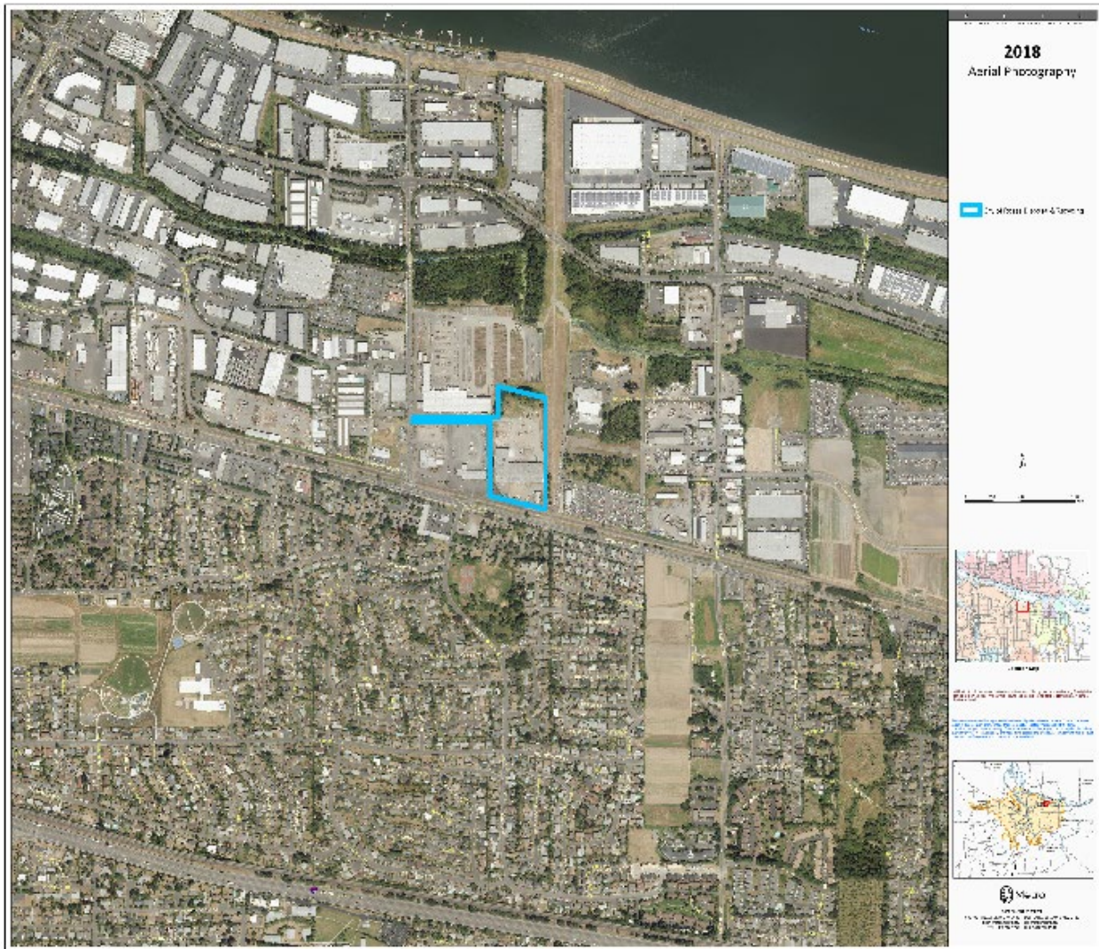
Photo 3: Aerial photo of COR Transfer Station located at 4530 NE 138 th Ave in Portland