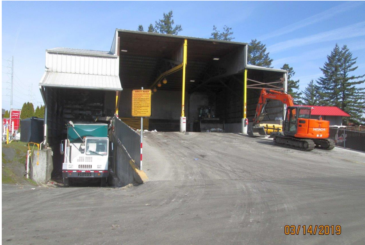
Photo 2: GSS Transfer located at 2131 NW Birdsdale Ave. in Gresham