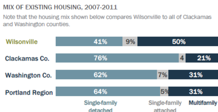
Figure 2: Mix of Existing Housing, Wilsonville Residential Land Study

Equitable Housing Strategic Plan. Wilsonville received a Metro Community Planning and Development Grant in 2016 for its Equitable Housing Strategic Plan. This Plan will assess affordability of the housing market and city demographics to help determine gaps between housing needs and supply. The goal is to adopt and implement programs and policies to address any gap(s) found by the Equitable Housing Strategic Plan. Due to the sudden passing of the project manager last summer, this project was put on hold for one year and is anticipated to be pursued later in 2018.