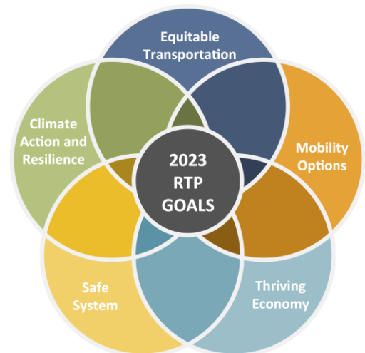
Draft 2023 RTP Goals developed by JPACT and Metro Council with input from MPAC and CORE

Now that the RTP Call for Projects to our city, county, state and special district partners is complete, Metro staff are seeking input on the draft project list on how these investments align with the policy framework set forth by Council and JPACT at their joint workshops in 2022. Staff is also continuing to conduct a technical analysis of how these investments collectively and individually meet our transportation needs 1 and advance RTP goals.