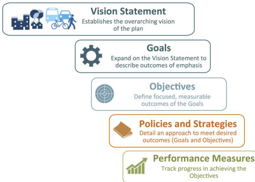
Figure 1. RTP performance-based planning and decision-making framework