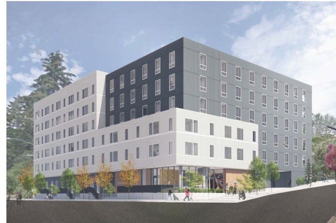
72 nd and Baylor Apartments Washington County Metro Housing Bond