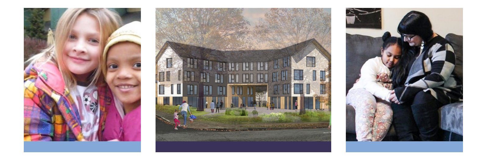
EXHIBIT A to IGA