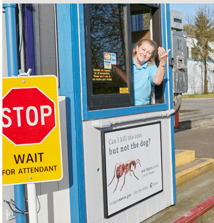
A Metro employee waves a garbage truck forward at Metro Central transfer station.

To enrich our communities and support our economy, Metro operates the Oregon Convention Center, Portland Expo Center and Portland's Centers for the Arts.