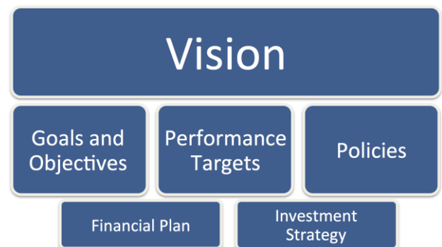
Figure 1. Elements of the Regional Transportation Plan