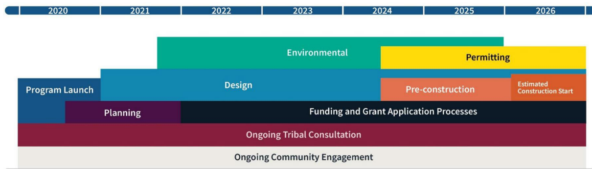
Figure 2: IBR Program Schedule of Activities (2020 through 2026)

Attachment 4 lists the draft, conceptual construction packages with an illustrative map. A summary schedule of IBR Program activities through the end of 2026 is shown in Figure 2. [Note: Activities funded through the proposed MTIP amendments continue past 2026.]