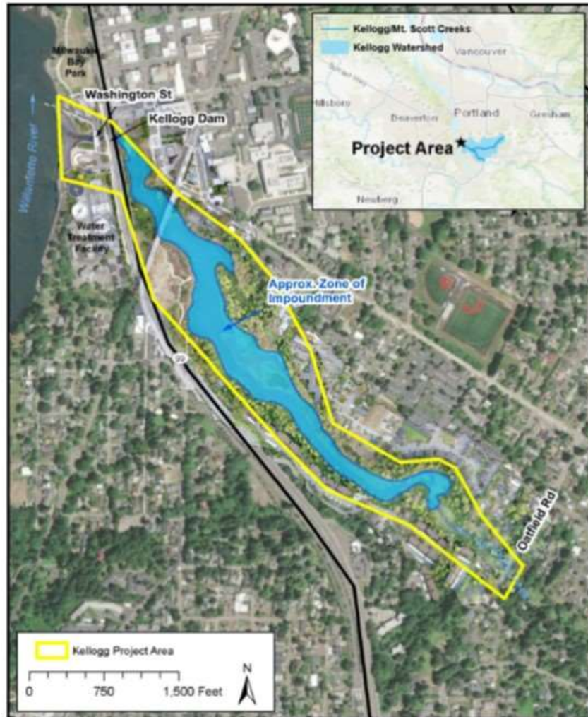
Figure 1. Potential project area overview and location area vicinity map for the Kellogg Restoration Project.