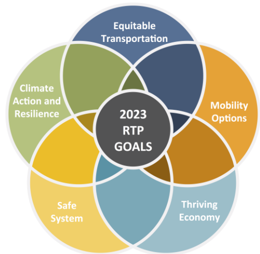
Draft 2023 RTP Goals developed by JPACT and Metro Council with input from MPAC and CORE

Initial findings from this analysis, public input received to date on the draft project list, and other information is summarized in the Briefing Book for JPACT and Metro Council in Attachment 1 . This information will help inform local, regional and state partners as they consider whether to make