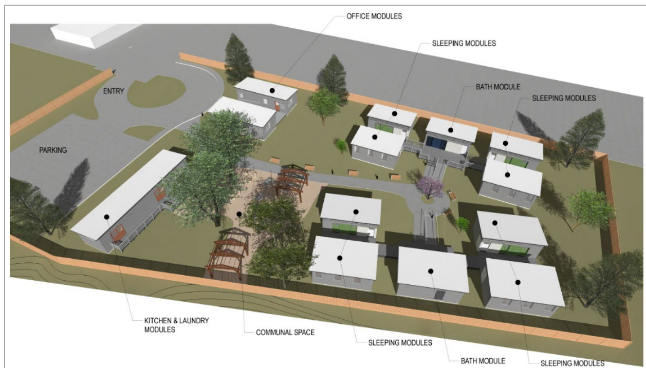
A 3D model of the future Clackamas Village, provided by ASA Construction

The future Clackamas Village will provide recovery-oriented emergency transitional housing to people experiencing homelessness. In Q3 the County published a Notice of Public Improvement Contract Opportunity and selected ASA Construction from among the proposals submitted for consideration, issuing a new $3.2M construction contract. Clackamas Village will be located next to the existing Veterans Village and follow a similar model. The 13 modular building structures will include a kitchen module, two office modules, two bathroom modules, and eight three-bedroom sleeping modules, for a total of 24 housing units. All units will be accessible by ramps and decks built on-site. The modular structures will be built off-site and installed onsite. Other site work will include foundations, utilities, storm ponds, landscaping, and paved areas. With site construction anticipated to take approximately 10 months, Clackamas Village is scheduled to open in early 2025.