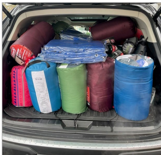
A volunteer fills her vehicle with survival gear for distribution at The Father's Heart emergency warming site

In January 2024, Clackamas County mobilized severe weather resources in response to the winter storm that impacted the entire community for several days with sleet, snow, freezing rains, high winds, and low overnight temperatures. Members across the Housing Services Team participated in County-wide coordination calls prior to, during, and after the weather event. Outreach during this time shifted to providing survival gear and immediate connection to warming shelter options. Outreach staff assisted in transporting vulnerable individuals to safe sheltering options. Housing Services staff volunteered at emergency warming shelter locations across Clackamas County and assisted in keeping individuals safe and providing goods, information, and resources. Vital supplies included sleeping bags, gloves, hand warmers, and warm clothing.