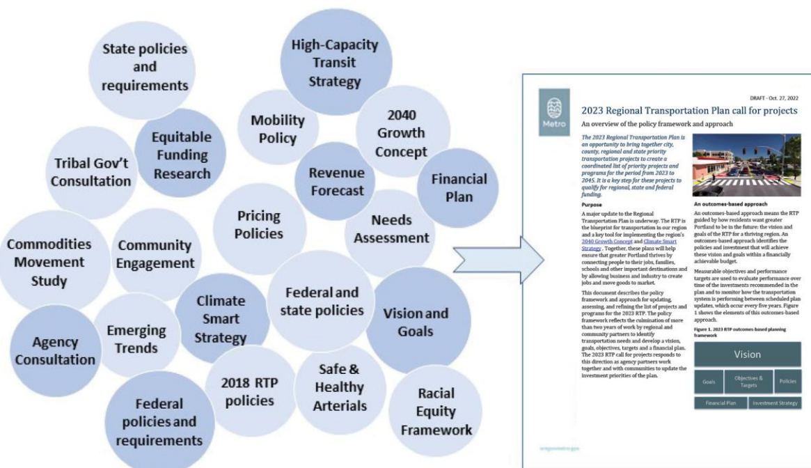
Figure 3. Elements informing the 2023 RTP call for projects

These elements come together to inform the policy framework for call for projects and provide additional information to guide how investments in roads, bridges, bikeways, sidewalks, transit service and other needs are addressed and prioritized. The elements reflect extensive engagement with local elected officials, public agencies, Tribal governments, community-based organizations, business groups and the community at large.