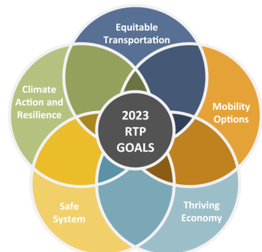
Draft 2023 RTP Goals developed by JPACT and Metro Council with input from MPAC and CORE

Now that the RTP Call for Projects to our city, county, state and special district partners is complete, Metro staff are seeking input on the draft project list on how these investments align with the policy framework set forth by Council and JPACT at their joint workshops in 2022. Staff is also conducting a technical analysis of how these investments collectively and individually meet our transportation needs 1 and advance RTP goals.